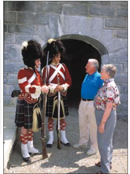
Halifax Citadel Soldiers.

TRAVEL TUNNEL” to 1864 and learn about the origins of this fascinating region. Meals included: breakfast.