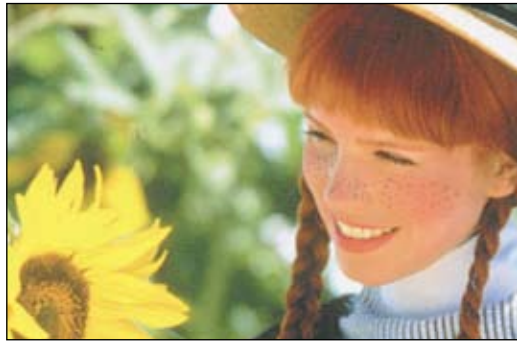
Anne of Green Gables.

24 25 FRANKENMUTH to IRON MOUNTAIN: Enjoy the fall colours as you travel north along the Interstate Highway in upper Michigan. Make a lunch stop in the resort town of Mackinaw City located at the southern end of the MACKINAW STRAITS BRIDGE. Cross the Mackinaw Bridge which connects the mainland to the Upper Peninsula, travel along the northern tip of Lake Michigan and overnight in Iron Mountain.