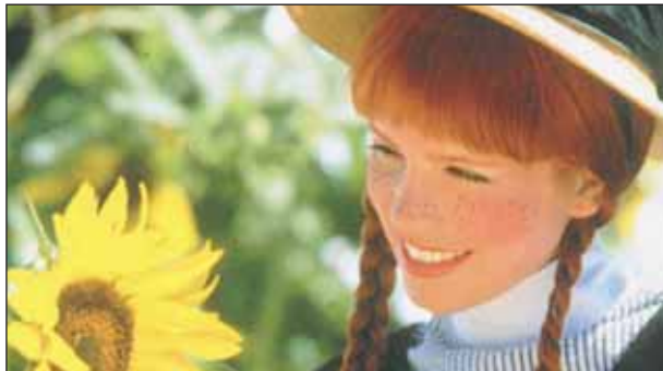
Anne of Green Gables.

14 15 CHARLOTTETOWN: A FREE DAY to enjoy historic Charlottetown from your well-located hotel! You may choose to explore historic Great George Street where there are signs to guide you and storyboards on the street corners telling tales of old.