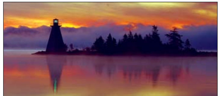
Baddeck Lighthouse, Baddeck, Nova Scotia.