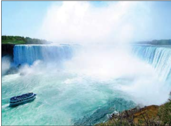
Niagara Falls. DAY

Fly to Toronto to experience a unique land of contrasts. View the awesome beauty of Eastern Canada and the Maritimes when the brilliant fall colours are at their best.