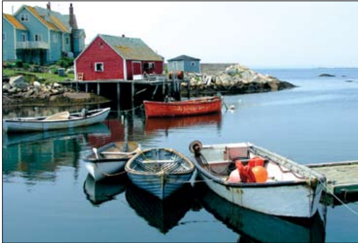
Peggy's Cove, Nova Scotia.

GRAHAM BELL MUSEUM to see the many exhibits of this famous inventor who spent much of his life on Cape Breton Island.