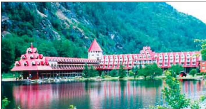
Three Valley Gap Chateau.

INCLUDED IN YOUR HOLIDAY: •First class transportation on an air-conditioned, washroom-equipped motor-coach •Standard accommodations and taxes •Services of an experienced Tour Director and Driver •Baggage handling, one average piece per person •Admissions for all attractions and sightseeing as outlined in the itinerary •Trip to Adams River to view the Salmon Spawning Process •Guided tour of Heritage Ghost Town and Antique Car Museum •Shelter Bay to Galena Bay Ferry •Halcyon Hot Springs •Thanksgiving Dinner •Rogers Pass •Driving Tour of Banff.