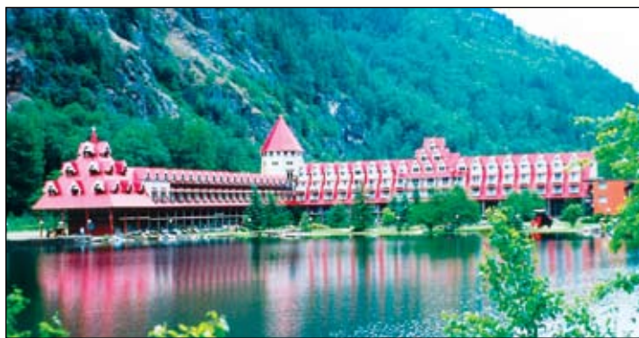
Three Valley Gap Chateau.

INCLUDED IN YOUR HOLIDAY: •First class transportation on an air-conditioned, washroom-equipped motor-coach •Standard accommodations and taxes •Services of an experienced Tour Director and Driver •Baggage handling, one average piece per person •Admissions for all attractions and sightseeing as outlined in the itinerary •Trip to Adams River to view the Salmon Spawning Process •Guided tour of Heritage Ghost Town and Antique Car Museum •Shelter Bay to Galena Bay Ferry •Halcyon Hot Springs •Farewell Dinner (October 10 date - Thanksgiving Dinner) •Rogers Pass •Driving Tour of Banff.