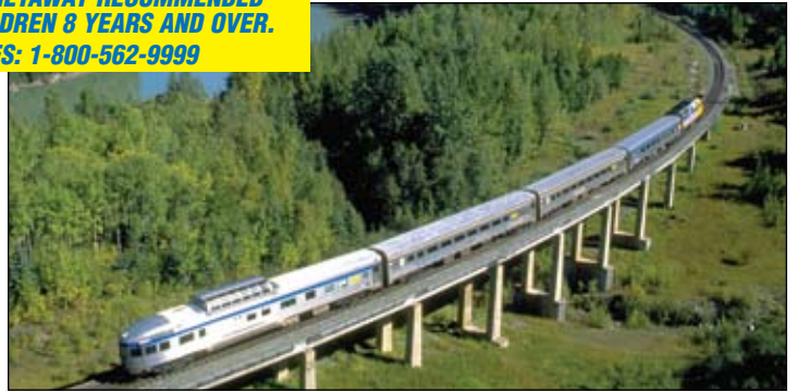
Via Rail's Skeena train.

and visit the NORTH PACIFIC CANNERY NATIONAL HISTORIC SITE. Known today as the North Pacific Historic Fishing Village, this historic site protects the oldest surviving salmon cannery village along British Columbia's coast. Established in 1889, this cannery was typical of those in remote locations in that it provided accommodation through the summer canning season. Little has changed since the plant closed in the late 1960's. Almost 30 buildings linked by wooden boardwalks are open for inspection.