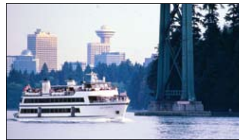
M.V. Britannia – Harbour Cruises Ltd.

6 THREE VALLEY GAP to CALGARY to HOME: Tuesday. Today's travelling provides a variety of unforgettable mountain scenery as you wind your way over the majestic ROGERS PASS . Enjoy a short DRIVING TOUR OF BANFF with lunch enroute. Arrive mid-afternoon in Calgary and then continue to Edmonton.