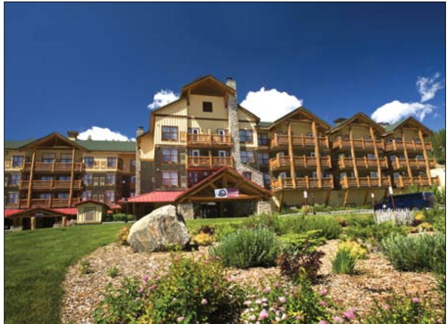
Trickle Creek Lodge.

2 KIMBERLEY: A morning GUIDED TOUR introduces you to the Bavarian City of the Rockies. Includes a tour of COMINCO GARDENS, the World's largest CUCKOO CLOCK, quaint MARYSVILLE and MARYSVILLE FALLS. This afternoon you may choose to relax and enjoy the beautiful hotel or enjoy the wide variety of festivities and entertainment. The International Old-Time Accordion Championships is an annual festival. Daily coach shuttles are provided from the hotel to the Platzl and the Civic Centre. Don't forget your dancing shoes for the FAMILY DANCE. Last year's entertainment featured the KIOTAC Massed Band and the Austin Kawa Band.