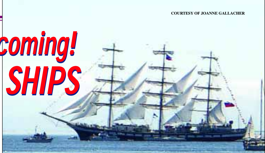
Tall Ships Parade: Victoria, BC, 2005.

INCLUDED IN YOUR HOLIDAY: •First class transportation on an air-conditioned, washroom-equipped motorcoach _Standard accommodations and taxes •Services of an experienced Tour Director and Driver _Baggage handling, one average piece per person •Name Badge •Travel Bag •Sightseeing and admissions as outlined in the itinerary •Ferry Crossings as indicated •Guided tour of Victoria •Butchart Gardens •Festival Multi-Day Pass •Chemainus •Vancouver area tour •Rogers Pass •Farewell Dinner •Driving Tour of Banff.