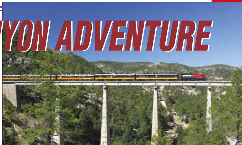
Chihuahua-Pacifico Railroad, Mexico.

Experience one of the world's great train trips through Mexico's stunning Copper Canyon on a once-in-a-lifetime train journey that takes you from sea level to almost 8,000 feet through the most scenic portions of the 25,000 square miles of canyon. Includes two nights overlooking the beautiful San Carlos Marina, an evening of entertainment in the colonial settlement of El Fuerte, lunch at a Mennonite museum and exploring the cave dwellings of the Tarahumara Indians.