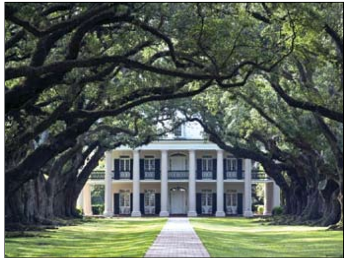
Oak Alley Plantation.