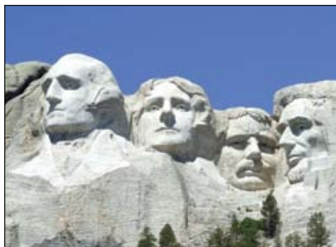
Mount Rushmore National Memorial, South Dakota.

14 15 LAFAYETTE to NEW ORLEANS: (2 nights) Sunday . Travel through the state capital, Baton Rouge, and visit beautiful OAK ALLEY PLANTATION. Enjoy the delightful experience of a CAJUN BUFFET. Arrive in New Orleans, the birthplace of Dixieland Jazz.