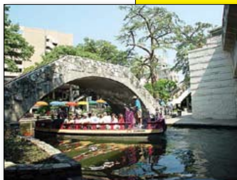
San Antonio, Texas Riverwalk.