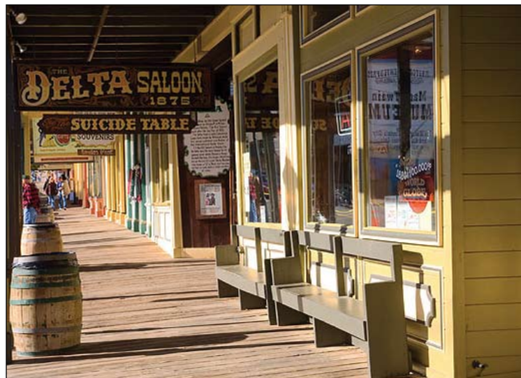
Virginia City Boardwalk.