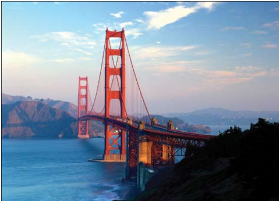
San Francisco's historic Golden Gate Bridge.

INCLUDED IN YOUR HOLIDAY: •First class transportation on an air-conditioned, washroom-equipped motorcoach •Quality accommodations and taxes •Services of an experienced Tour Director and Driver •Baggage handling, one average piece per person •Travel Bag •Travellers Handbook •Admissions for all attractions and sightseeing as outlined in the itinerary •Columbia Gorge Discovery Center •Oregon Coast Aquarium •Old Town Florence •Oregon Dunes National Recreation Area •Myrtlewood Factory •Redwood National Park •Avenue of the Giants •Picnic Lunch •Guided tour of San Francisco •Cable Car Ride •Pier 39 •Bay Cruise •Napa Valley Wine Train including a gourmet lunch •Wine tasting •Lake Tahoe •8 Meals including: 5 Continental Breakfasts, 1 Gourmet Lunch, 1 Picnic Lunch and a Farewell Dinner.