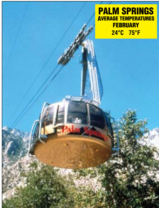
Palm Springs Aerial Tramway.

PALM SPRINGS AVERAGE TEMPERATURES FEBRUARY 24°C 75°F