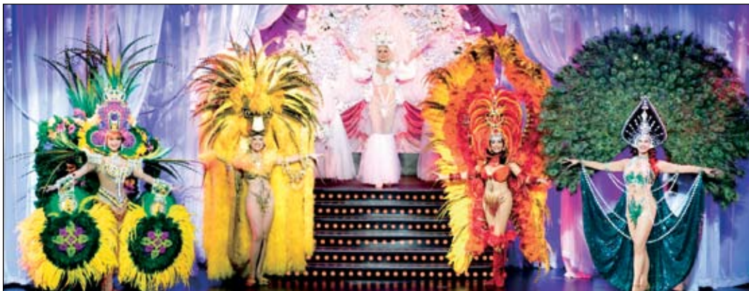
Palm Springs Follies.

INCLUDED IN YOUR HOLIDAY: •First class transportation on an air-conditioned, washroom-equipped motorcoach •Quality accommodations and taxes •Services of an experienced Tour Director and Driver •Baggage handling, one average piece per person •Travel Bag •Travellers Handbook •Admissions for all attractions and sightseeing as outlined in the itinerary •Welcome Reception •Las Vegas driving tour •Villafest •Guided city tour of Palm Springs •Shield Date Farm •Aerial Tramway •The Follies •The Living Desert Museum •Fremont Street Experience •Virgin River Canyon •Driving tour of Mormon Tabernacle Square •6 Meals including •Farewell Dinner •4 Continental Breakfasts.