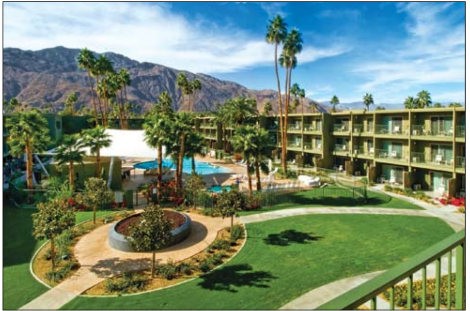
Holiday Inn Resort.

DESERT – a unique facility that is a zoo, an endangered species conservation centre, botanical gardens, natural history museum, wilderness park, nature preserve and an education centre. Don't miss the "Wildlife Wonders" live animal show, a fascinating wildlife presentation featuring desert mammals, reptiles and birds of prey. A "mall break" allows time for optional lunch and shopping prior to returning to the hotel.