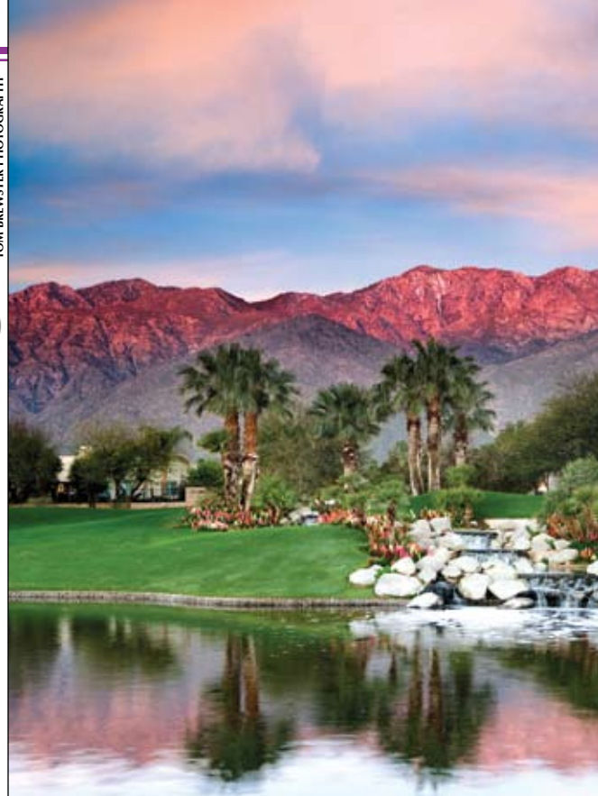
Palm Springs Sunrise.

Amenities include restaurant with patio dining, lounge, coffeemaker, hair-dryer, iron/board, refrigerator, balcony or patio, heated outdoor pool, two heated whirlpools, cabana bar, laundry facilities, fitness facility, internet access, complimentary shuttle to downtown. Golf course, driving range, horseback riding and tennis courts are located nearby. This evening – Thursday night – join your travelling companions for optional dinner, entertainment and browsing at VILLAGEFEST. Palm Canyon Drive is closed to traffic and is transformed into a vibrant pedestrian street fare.