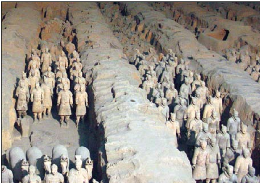
Excavation site of the Terracotta Warriors.

8 XI'AN: Begin your morning with a private Tai Chi lesson, a highly-revered Chinese martial art that is both invigorating and relaxing. Then travel to the countryside to visit a rural village. Meet local residents and gain insight into their daily life during a tour of a local school, a visit to a farm and lunch at a farmer's home. Meals included: breakfast, lunch.