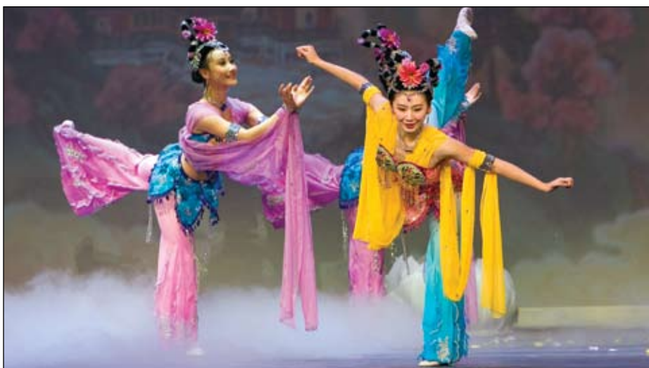
Chinese Acrobatic Show.

10 SHANGHAI: Enjoy a full day excursion to the water village of ZHUJIAJIAO, an ancient city located on the banks of Dianshan Lake. After more than one thousand years, Ming & Qing dynasty buildings still stand and 36 ancient stone bridges cross the canal that runs through the center of town. Visit the rice museum, enjoy a boat ride on the canal and have time to shop. Tonight take in the energy and excitement of the Chinese ACROBATIC SHOW. Meals included: breakfast, lunch, dinner.