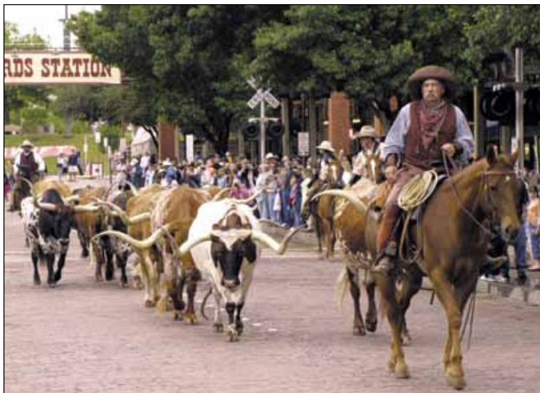
Fort Worth Stockyards cattle drive.

19 20 KANSAS CITY to MITCHELL: Friday . Continue your travels northward into South Dakota to Sioux Falls and then west to Mitchell for overnight.