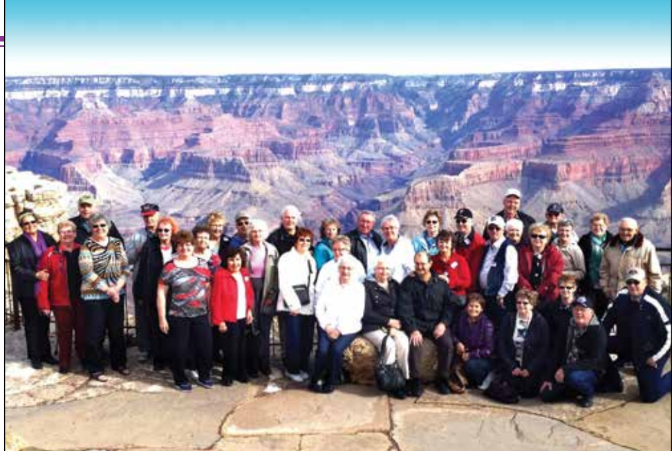
Grand Canyon, AZ.