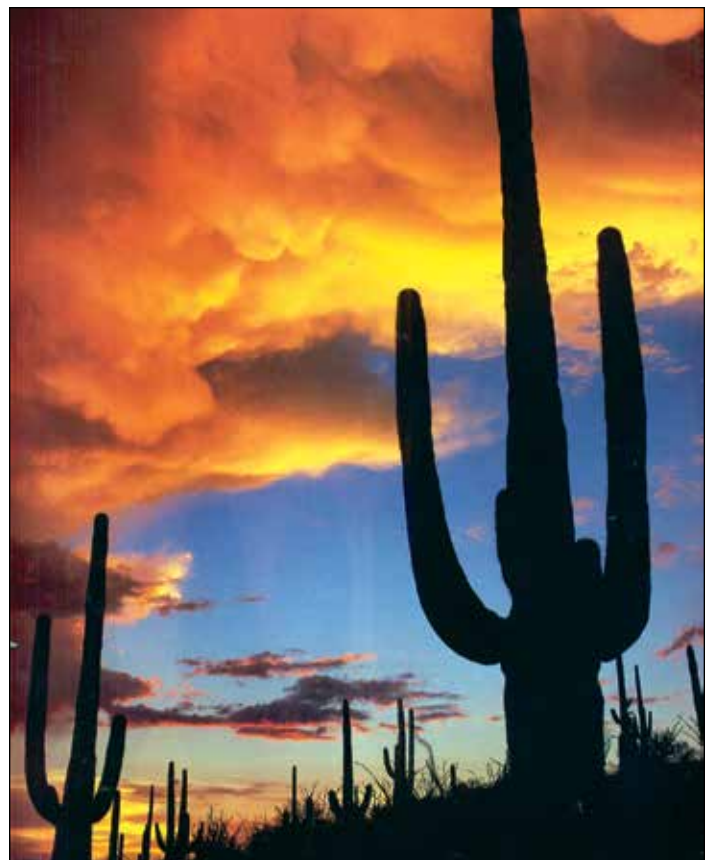
Saguaro National Park, Tucson.

EARLY BOOKING DISCOUNT: $55.00 twin sharing per person.