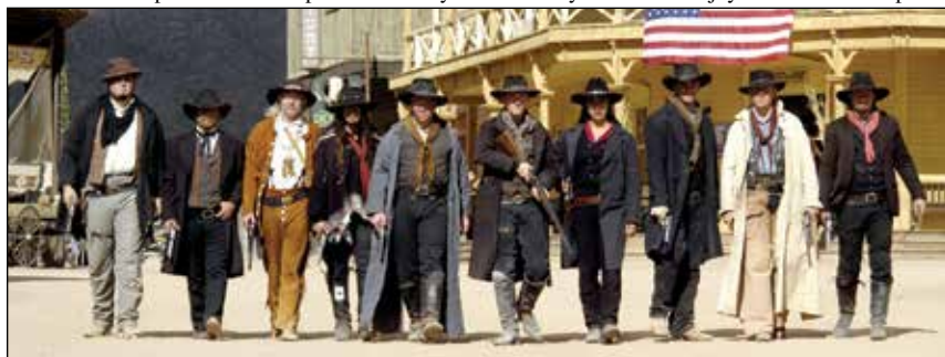
Gunfight at Tombstone, AZ.