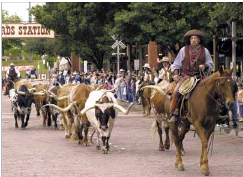
Fort Worth Stockyards cattle drive.

19 20 KANSAS CITY to MITCHELL: Friday . Continue your travels northward into South Dakota to Sioux Falls and then west to Mitchell for overnight.