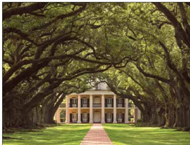
Oak Alley Plantation.