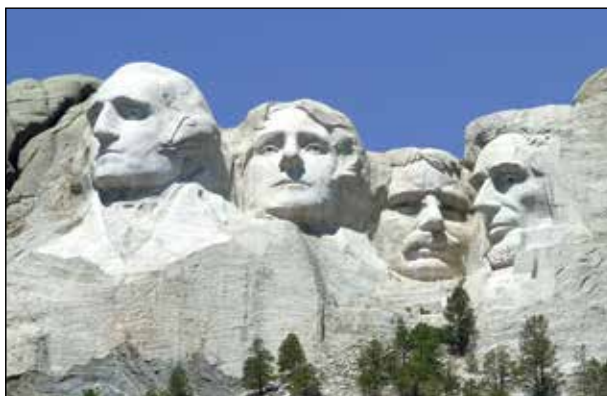
Mount Rushmore National Memorial, SD.

20 21 MITCHELL to RAPID CITY: Saturday . After a stop at the unique WALL DRUGS visit two of the world's greatest mountain carvings. MOUNT RUSHMORE NATIONAL MEMORIAL depicts four presidents' faces and is the world's largest mountain carving. It was sculpted from the granite of the Black Hills from 1929 to 1941. 2018 is the 77th Anniversary of the completion of the Mount Rushmore National Memorial. Then visit CRAZY HORSE MEMORIAL, an ongoing sculpture being carved in tribute to the North American Indian. Overnight in Rapid City in the heart of the BLACK HILLS NATIONAL FOREST.