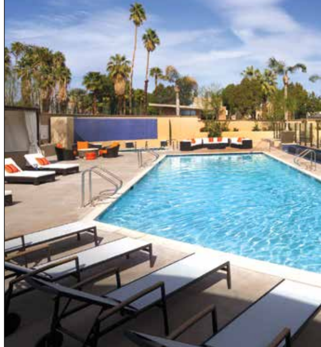
Hyatt Palm Springs.

iron/board, fridge, separate living room, private balcony, safe, and complimentary wifi. A daily happy hour in the lobby with discounted drinks and complimentary snacks, a heated outdoor pool and hot tub will add to your enjoyment.