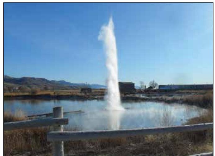
Old Perpetual Geyser, Lakeview, Oregon.

INCLUDED IN YOUR HOLIDAY: •First class transportation on an air-conditioned, washroom-equipped motorcoach •Quality accommodation and tax •Services of an experienced Tour Director and Driver •Baggage handling, one average piece per person •Sightseeing and admissions as outlined in the itinerary •Trail of the 49ers Interpretive Centre •Carson Valley •Genoa •Carson City •Virginia City Tour •North Lake Tahoe •Optional Shopping •Modoc National Forest •Goose Lake •Wine tasting •Old Perpetual •Meals Include: 3 Continental Breakfasts, Farewell Dinner.