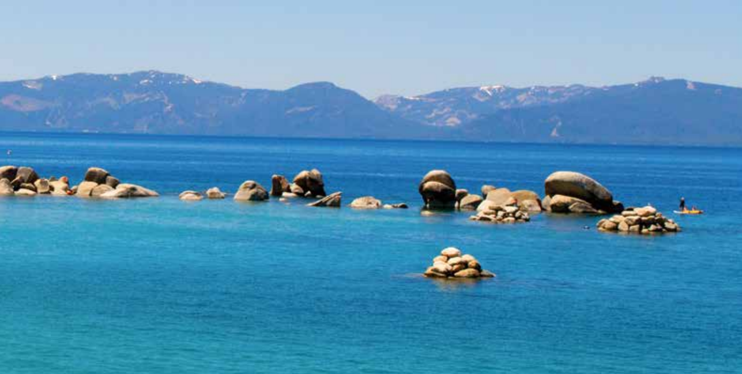
North Lake Tahoe, Nevada.

5 RENO: Wednesday. Today our travels take us on Highway 431 to visit NORTH LAKE TAHOE . Have your cameras ready for views of this beautiful freshwater lake which straddles the California/Nevada border. Early afternoon, return to Reno with time for OPTIONAL SHOPPING . The coach will return to the hotel for those who prefer not to shop.