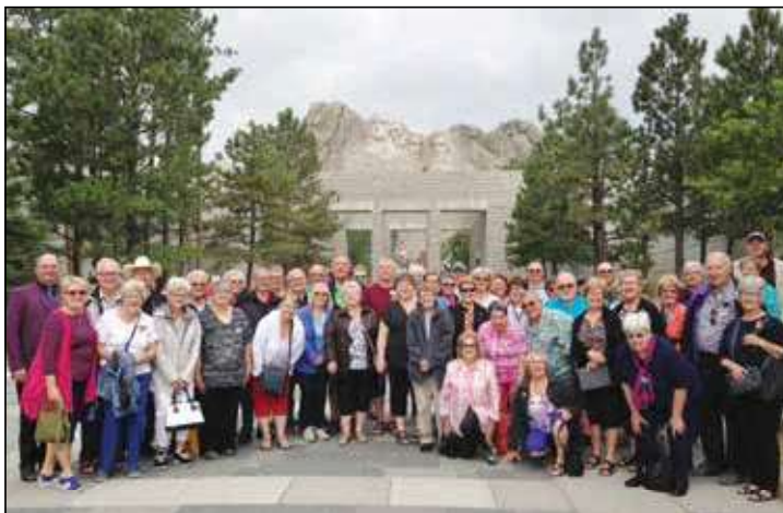
Mount Rushmore National Memorial.

8 SWIFT CURRENT to CALGARY to EDMONTON: Saturday. This is going home day. Return home with many memories of your scenic tour.