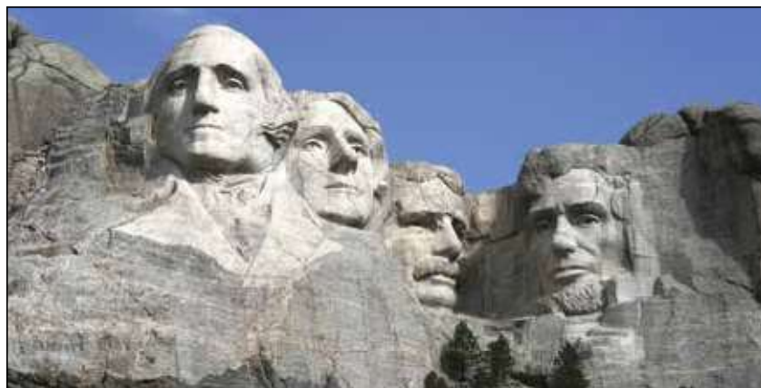
Mount Rushmore National Memorial.