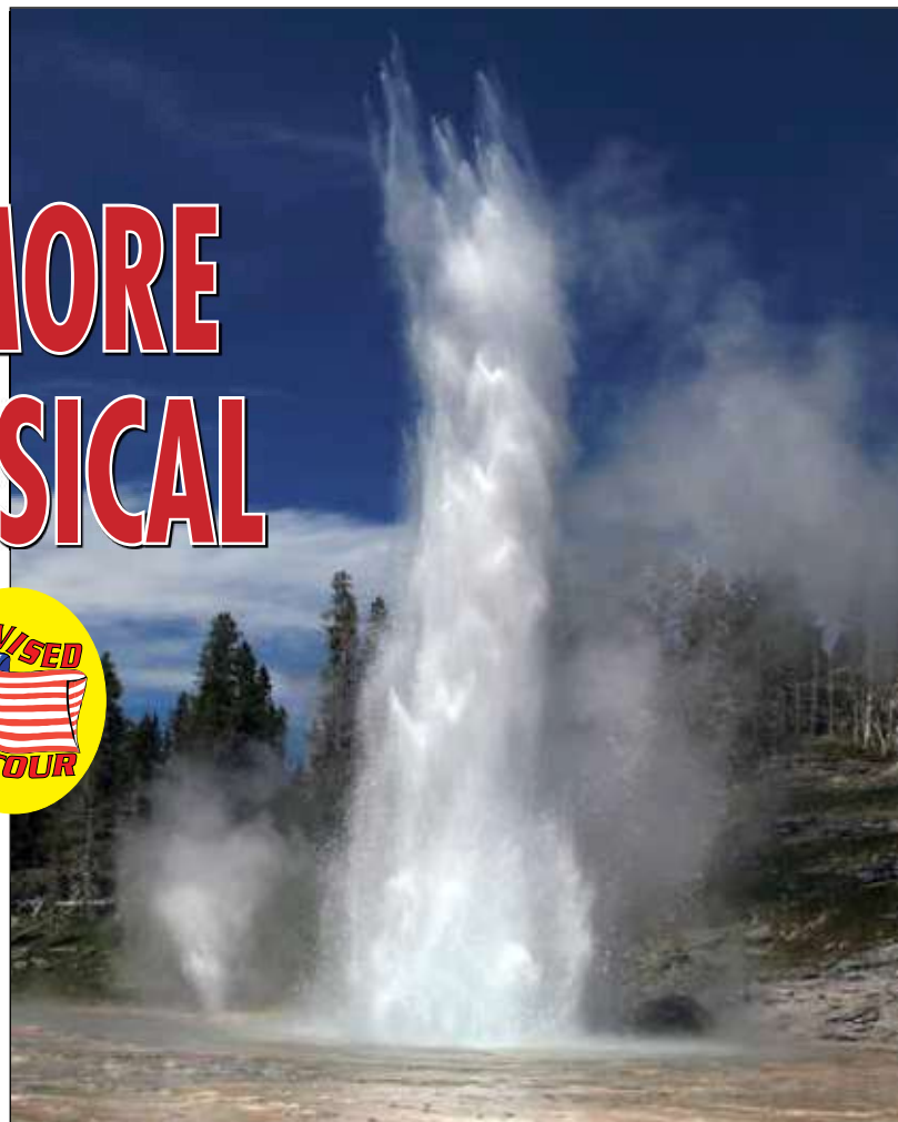
Grand geyser and vent geyser in Yellowstone National Park.