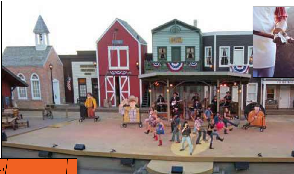
Medora Musical, Medora, North Dakota.