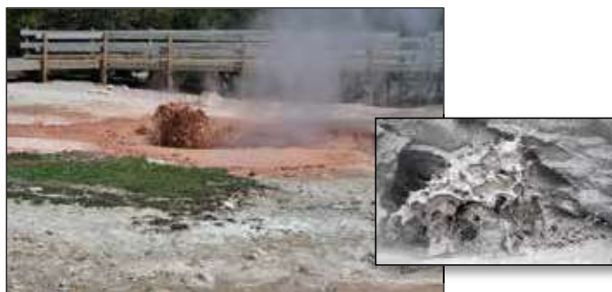
Paint Pots, Yellowstone National Park.