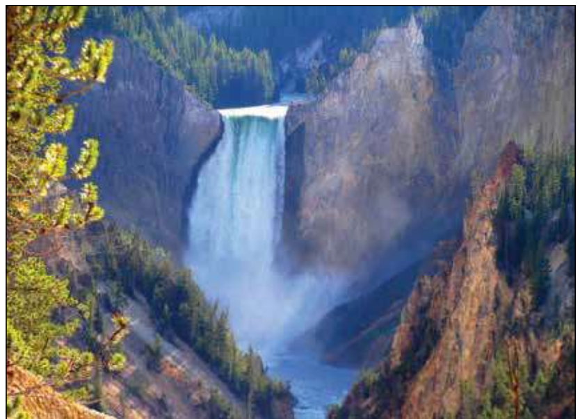
Grand Canyon, Yellowstone National Park.

carvings – CRAZY HORSE MEMORIAL and MOUNT RUSHMORE NATIONAL MEMORIAL. Return to Deadwood for overnight.