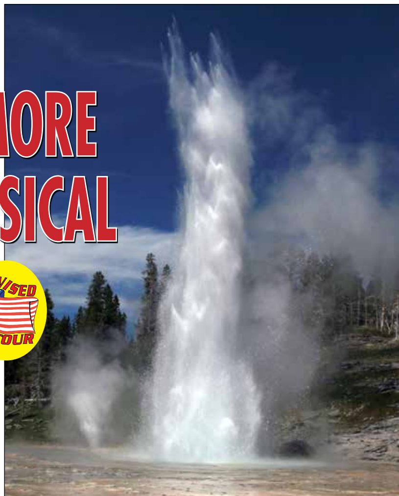
Grand geyser and vent geyser in Yellowstone National Park.