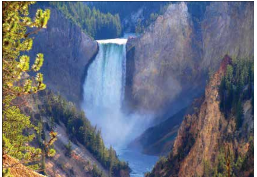
Grand Canyon Falls, Yellowstone National Park.