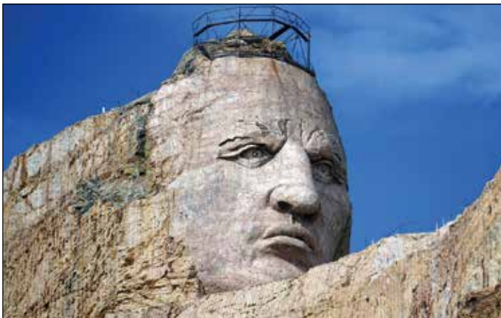
Crazy Horse Memorial.

INCLUDED IN YOUR HOLIDAY: •First class transportation on an air-conditioned, washroom-equipped motorcoach •Quality accommodation and tax •Services of an experienced Tour Director and Driver •Baggage handling, one average piece per person •Travel Bag •Admission to attractions and sightseeing as outlined in the itinerary •Welcome Reception •Yellowstone National Park including: Old Faithful, Grand Canyon of Yellowstone, Lower Falls, Paint Pots, West Thumb •Buffalo Bill Center of the West •1880 Train •Black Hills National Forest •Mount Rushmore National Memorial •Crazy Horse Memorial •North Dakota Badlands •Pitchfork Fondue Dinner •Medora Musical •Meals Include: All Breakfasts (Continental), 1 Fondue Steak Dinner.