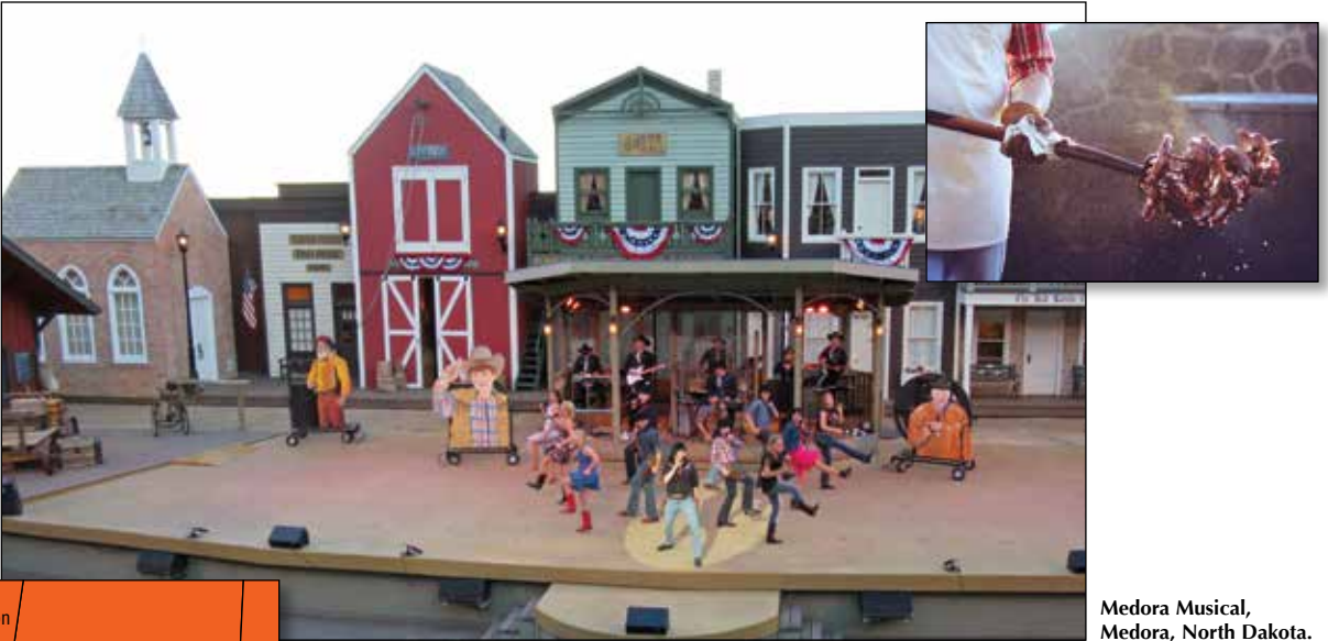
Medora Musical, Medora, North Dakota.