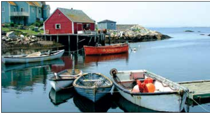
Peggy's Cove, Nova Scotia.

historic Great George Street or watch for cruise ships while wandering the waterfront of Confederation Landing Park. Tickle your taste buds with one of many local flavours along the way.