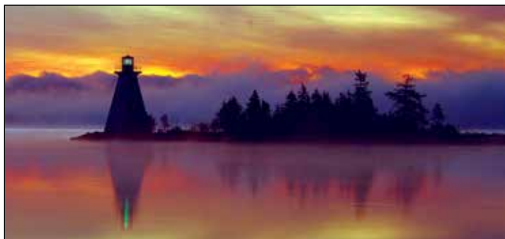
Baddeck, Nova Scotia.