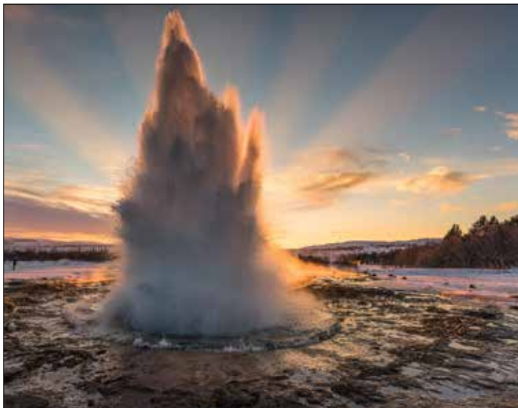
The Geyser Strokkur on the Golden Circle.