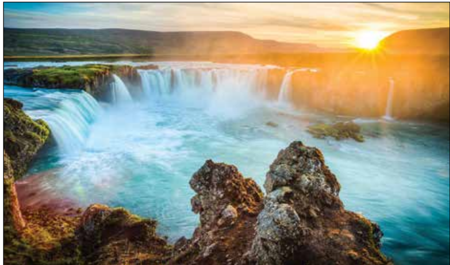
Iceland waterfall at sunrise.