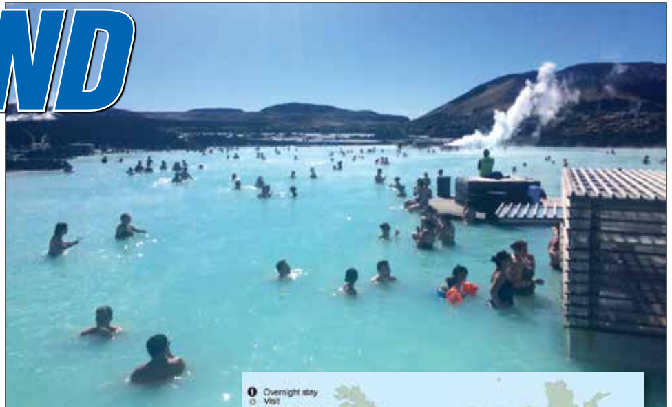
Geothermal Myvatn Nature Baths.

Discover Iceland, a land and culture forged by fire and ice.