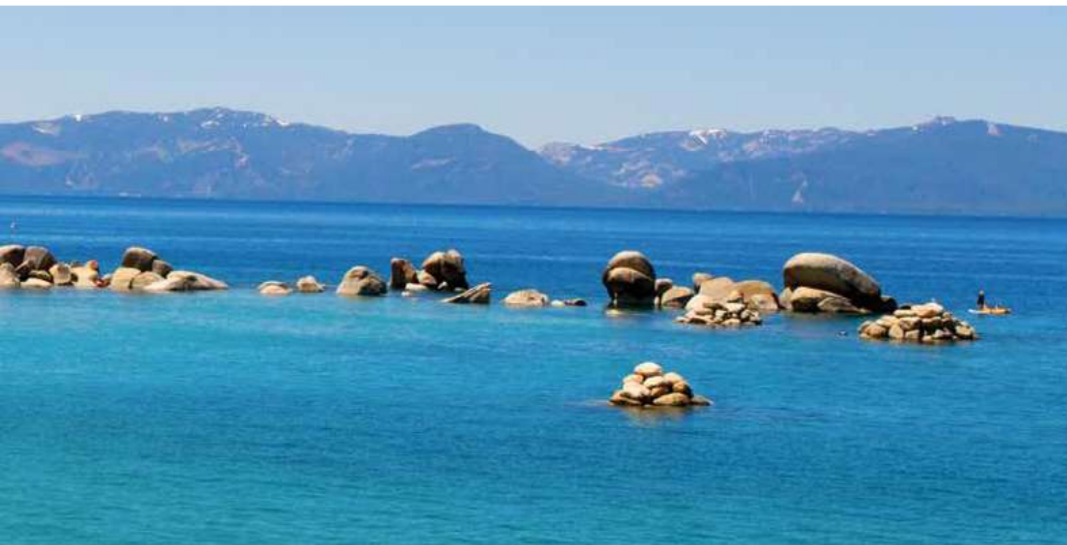
North Lake Tahoe, Nevada.

5 RENO: Wednesday. Enjoy a free day in Reno today, Veteran's Day. Explore the city, take in Nevada's Official Veteran's Day Parade, or just enjoy the variety of activities at your hotel. If you wish, in the early afternoon, join us for OPTIONAL SHOPPING . Afterwards, return to the hotel for overnight.