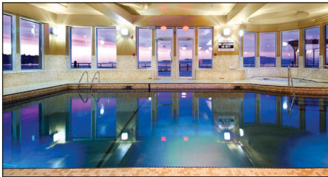
The Beach Club Resort indoor pool and hot tub.

3 NEW WESTMINSTER to PARKSVILLE: (3 nights) Monday. Board a BC FERRY at Horseshoe Bay to enjoy a scenic sailing across the Strait of Georgia to Nanaimo, a vibrant harbour city. Travel north along the coastline to the seaside community of QUALICUM BEACH where you can wander the downtown pedestrian-friendly streets exploring unique shops, bookstores, antique shops, restaurants, outdoor cafes and galleries. Discover MORNINGSTAR FARM and LITTLE QUALICUM CHEESEWORKS with a self-guided tour to meet the farm animals, watch the robotic milker in action, learn about cheese making and enjoy some samples in the farmgate store. Continue to Parksville for a three-night stay at the luxurious Beach Club Resort just steps from the water to experience island living at its finest! Join your travel companions for a HOSTED DINNER in the Pacific Prime Restaurant at your hotel with its famous beachfront patio just off the Parksville Beach Boardwalk.