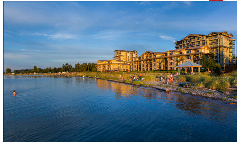
The Beach Club Resort, Parksville, BC.

INCLUDED IN YOUR HOLIDAY: •First class transportation on an air conditioned, washroom equipped motorcoach •Quality accommodation and tax •Services of an experienced Tour Director and Driver •Baggage handling, one average piece per person •Travel Bag •Admission to attractions and sightseeing as outlined in the itinerary •Ferry crossings as indicated •Qualicum Beach •Morningstar Farm and Little Qualicum Cheeseworks •Milner Gardens •Afternoon High Tea at Camellia Tea Room •Chemainus Lunch and Theatre Performance •Driving Tour of Murals •Fraser Canyon •Rogers Pass •Driving tour of Banff •Meals Include: 5 Continental Breakfasts, 1 Afternoon High Tea, 1 Dinner at The Beach Club Resort.