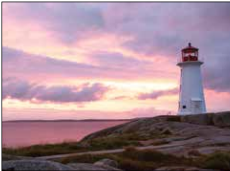
Peggy's Cove, Nova Scotia.

Discover some of the world's most spectacular scenery today as you travel north to GROS MORNE NATIONAL PARK, designated a World Heritage Site. The steep cliffs, deep lakes and quaint fishing villages are a photographer's dream. Tour the park's DISCOVERY CENTRE overlooking spectacular Bonne Bay and enjoy lunch in Woody Point. Continue to Gander, not only an important re-fuelling stop for military aircraft crossing the Atlantic Ocean during World War II, but overnight in the town that inspired the now-legendary musical 'Come From Away'. With a LOCAL GUIDE experience stories of the 9/11 tragedy from those who welcomed the world into their homes.