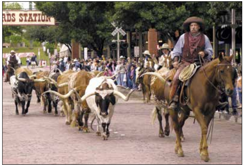
Fort Worth Stockyards cattle drive.

19 20 KANSAS CITY to MITCHELL: Saturday . Continue your travels northward into South Dakota to Sioux Falls and then west to Mitchell for overnight.