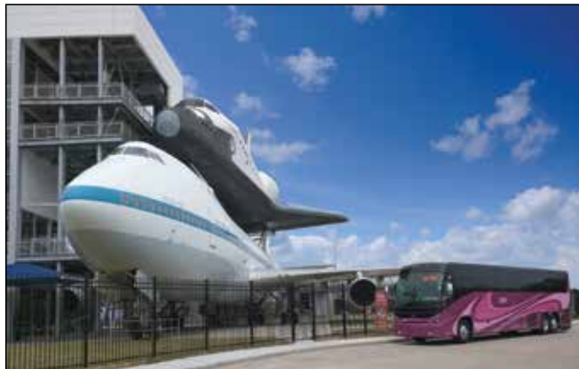
Space Center Houston.

24 SWIFT CURRENT to CALGARY to EDMONTON: Wednesday . Today is "Going Home" day with many memories of your travels through ten American states and two Canadian provinces.