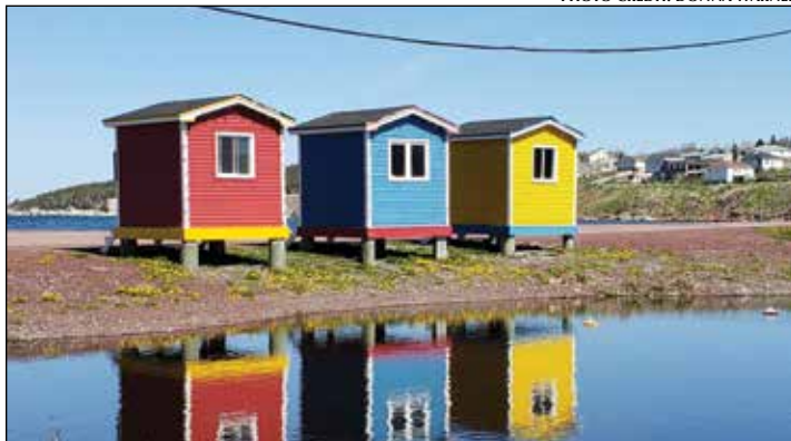
Fishing Stages Cavendish, Newfoundland/Labrador.