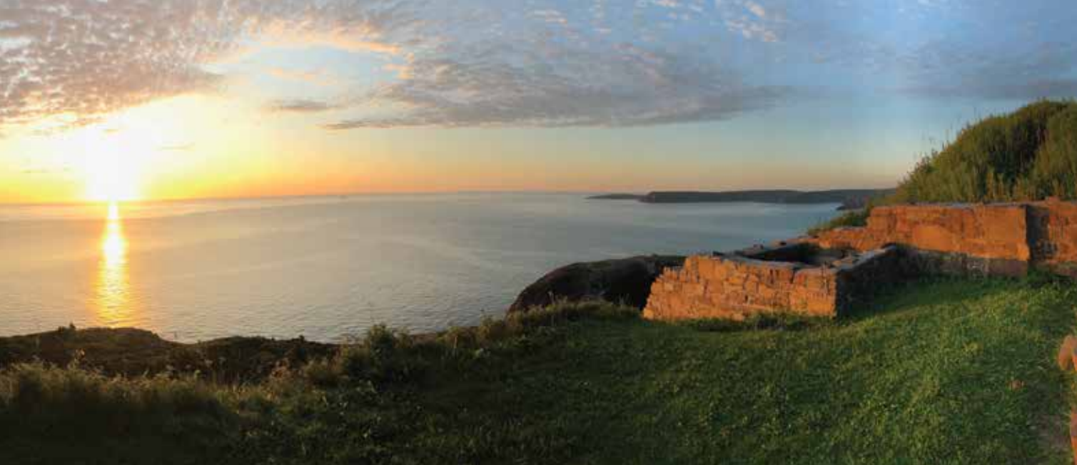
Sunrise at Signal Hill.

5 PORT BLANDFORD/CLARENVILLE: A day of discovery awaits, starting in the historic village of TRINITY, one of the oldest communities in North America. Celebrate the beginning of European history while walking the same cliffs as walked by John Cabot when he claimed "Buena Vista" for King Henry in 1497. Visit RYAN PREMISES NATIONAL HISTORIC SITE in Bonavista. Spend a relaxing afternoon enjoying the seashore, chatting with the locals or touring the many historic premises for an opportunity to truly understand the inshore fishing techniques that have allowed Newfoundlanders to thrive for hundreds of years. Meals Include: Breakfast, Lunch.