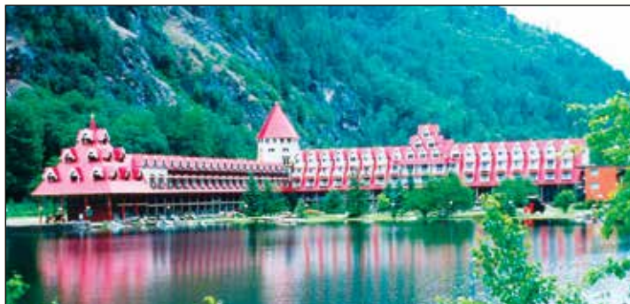
Three Valley Lake Chateau.

INCLUDED IN YOUR HOLIDAY: •First class transportation on an air-conditioned, washroom-equipped motorcoach •Quality accommodation and tax •Services of an experienced Tour Director and Driver •Baggage handling, one average piece per person •Admission to attractions and sightseeing as outlined in the itinerary •Trip to Adams River to view the Salmon Spawning Process •Tour of Heritage Ghost Town and Antique Car Museum •Shelter Bay to Galena Bay Ferry •Halcyon Hot Springs •Driving Tour of Banff •Meals Include: 3 Breakfasts, 3 Dinners including Thanksgiving Dinner.