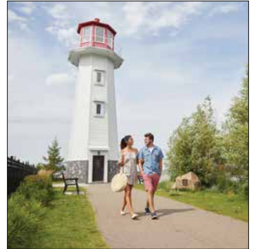
Sylvan Lake Lighthouse.

includes a 1920's barbershop, railway station, schoolhouse, homestead cottage and trapper's cabin, an artifact collection including household items, farm machinery and the "World's Largest Collection of International Trucks". LUNCH is included. Taking the scenic route, travel north through the heart of ranching and farming country before an afternoon break at Ma-Me-O Beach Jubilee Park. Travel east, joining the QE II enroute to Edmonton. Bid farewell to your new-found friends as your Sylvan Lake Getaway draws to a close.