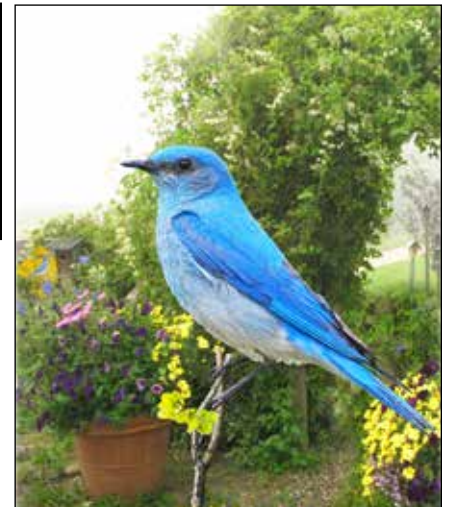
Ellis Bird Farm – Mountain Bluebird.