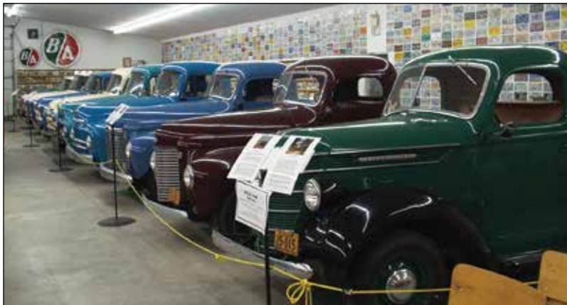
PasKaPoo Park – Truck Museum.

INCLUDED IN YOUR HOLIDAY: •First class transportation on an air-conditioned, washroom-equipped motorcoach •Quality accommodation and tax •Services of an experienced Tour Director and Driver •Baggage handling, one average piece per person •Admission to attractions and sightseeing as outlined in the itinerary •Ellis Bird Farm •PasKaPoo Historical Park •Meals Include: 1 Hot Breakfast, 2 Lunches.