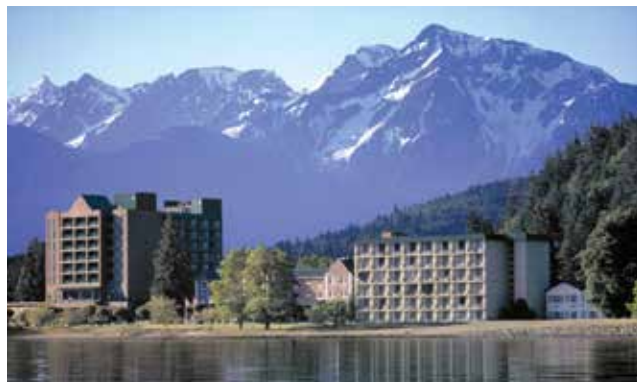
Harrison Hot Springs Resort and Spa.

Complimentary robe supplied for your stay at Harrison Hot Springs Resort.