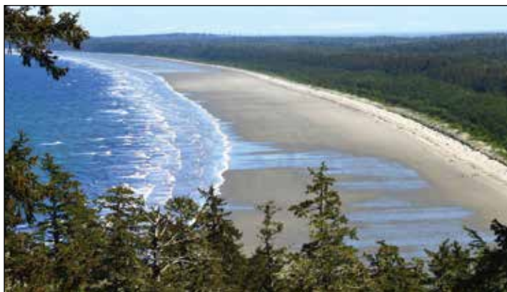
Haida Gwaii beach.