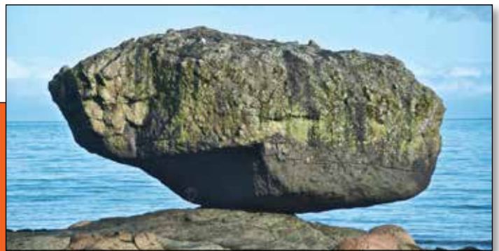
Balance Rock at Skidegate.