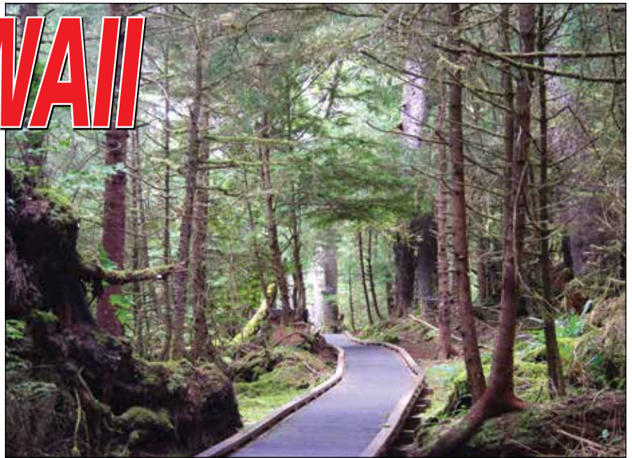
Tow Hill walking trail.