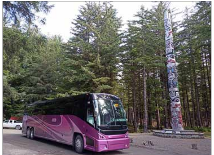
The Solstice Pole, Taaw Hill, Hiellen.

Gitksan and Haida cultures are very similar. Tonight enjoy a 'MEET and GREET' with your travel companions.