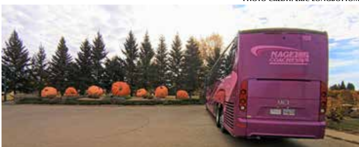
Smoky Lake pumpkins.