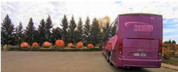
Smoky Lake pumpkins.