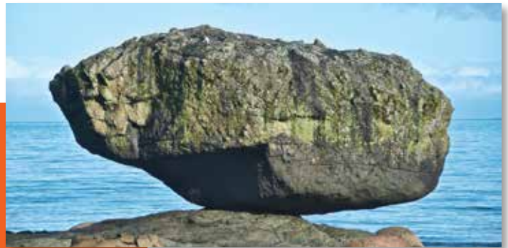
Balance Rock at Skidegate.