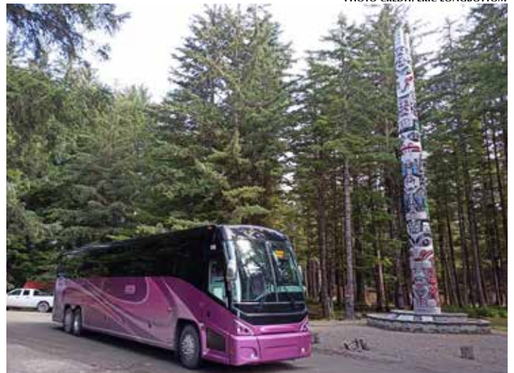
The Solstice Pole, Hiellen.

very similar. Upon arrival at your hotel in Terrace enjoy a 'MEET and GREET' with your travel companions.