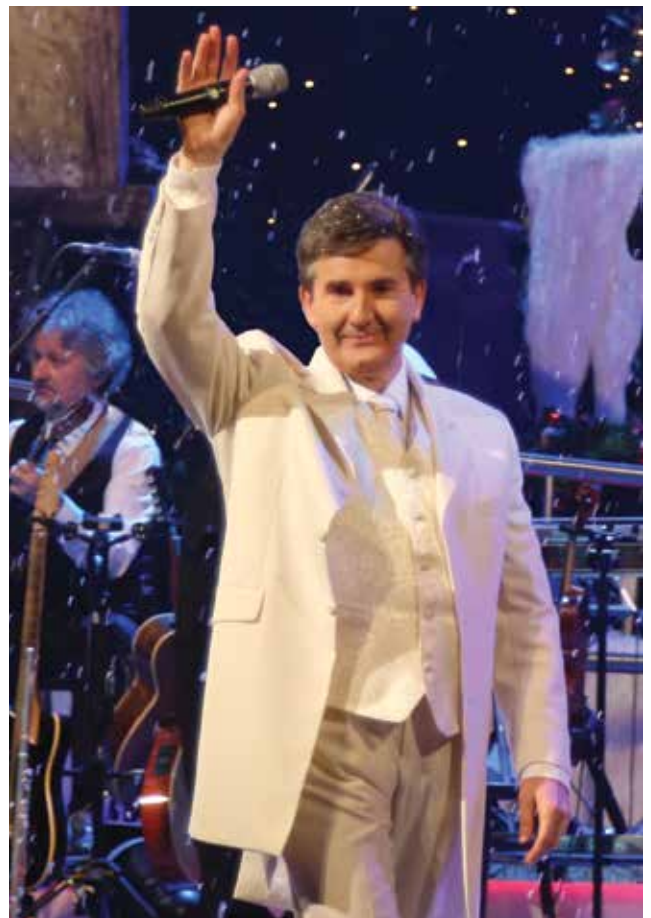
2022 Entertainer Daniel O'Donnell.