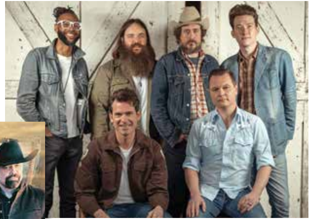
Old Crow Medicine Show.

INCLUDED IN YOUR HOLIDAY: •First class transportation on an air-conditioned, washroom equipped motorcoach •Quality accommodation and tax •Services of an experienced Tour Director and Driver •Baggage handling, one average piece per person •Admission to attractions and sightseeing as outlined in the itinerary •Daily admission into Norsk Høstfest •Daily transportation by motorcoach to/from Høstfest •Daily shuttle tickets included only when staying at Sleep Inn •Reserved seating for four Celebrity Shows •Continuous entertainment on various stages •Ongoing activities including Scandinavian Arts, Crafts, Handiwork and Antique Displays, Food Booths •Area Driving Tour •Scandinavian Heritage Park •Meals Include: Continental Breakfasts; Alberta 7, Saskatchewan 5.