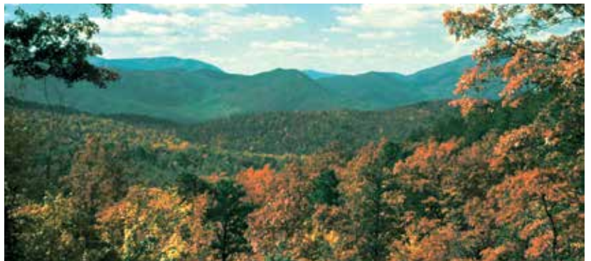
Autumn in the Smoky Mountains.

21 SWIFT CURRENT to CALGARY to EDMONTON: Tuesday . Today is "Going Home" day with many vivid memories of your music cities tour.