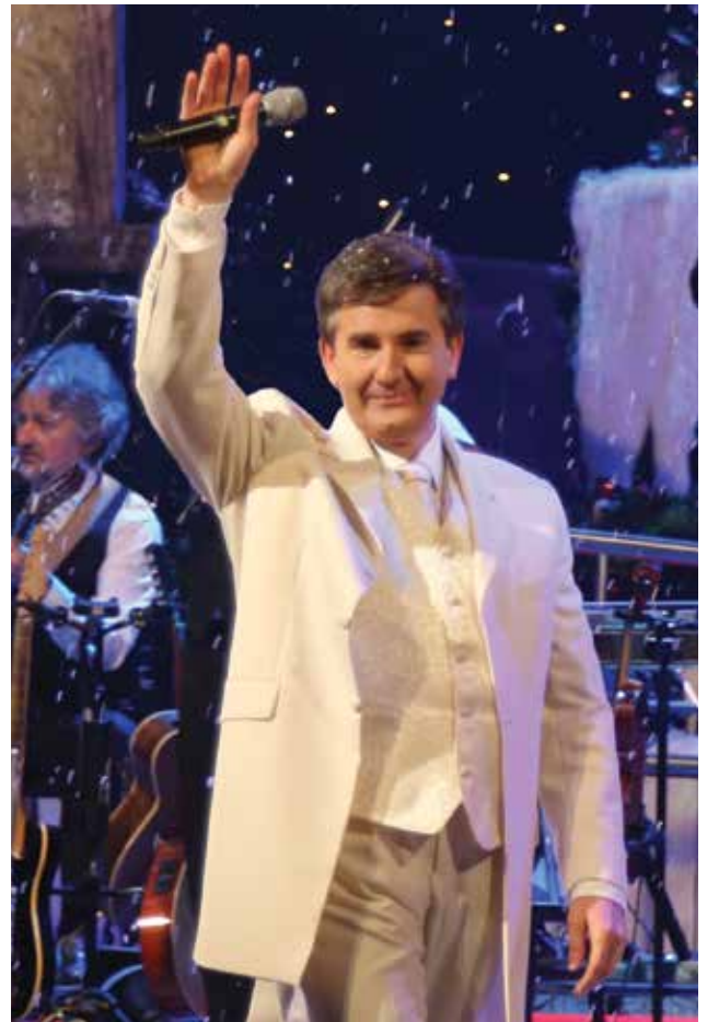
2022 Entertainer Daniel O'Donnell.

stages. Your tour includes reserved seating for FOUR MAIN STAGE CELEBRITY SHOWS as well as leisure time to take in some great entertainment on the free stages and optional celebrity shows. Daily shows at 1:00 p.m. and 7:00 p.m. Immerse yourself in the proud heritage and culture of the five Nordic countries Denmark, Finland, Iceland, Norway and Sweden with authentic cuisine and handcrafted Norsk merchandise. You may want to join our AREA DRIVING TOUR with a picture stop at the SCANDINAVIAN HERITAGE PARK .