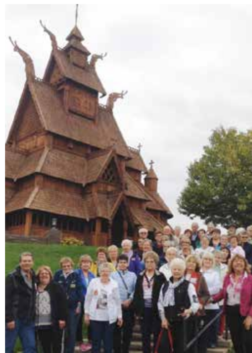
Scandanavian Heritage Park.