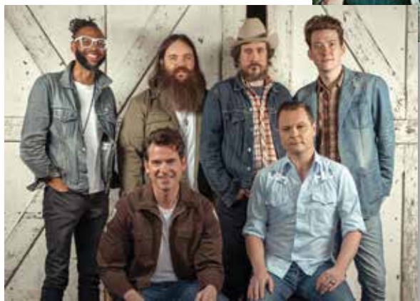
Old Crow Medicine Show.