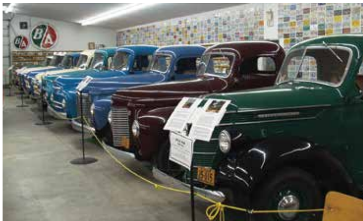
PasKaPoo Historical Park – International Truck Museum.

2 SYLVAN LAKE to RIMBEY to MA-ME-O BEACH to EDMONTON: Wednesday. Begin your day with an included hot BREAKFAST before departing from your hotel. This morning visit one of Rimbey's main attractions, PASKAPOO HISTORICAL PARK & SMITHSON INTERNATIONAL TRUCK MUSEUM . Preserved by the Rimbey Historical Society, this park includes a 1920's barbershop, railway station, schoolhouse, homestead cottage and trapper's cabin, an artifact collection including household items, farm machinery and