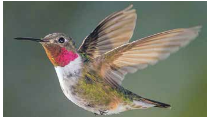
Ellis Bird Farm – Ruby Throated Hummingbird.

INCLUDED IN YOUR HOLIDAY: •First class transportation on an air-conditioned, washroom-equipped motorcoach •Quality accommodation and tax •Services of an experienced Tour Director and Driver •Baggage handling, one average piece per person •Admission to attractions and sightseeing as outlined in the itinerary •Ellis Bird Farm •PasKaPoo Historical Park •Meals Include: 1 Hot Breakfast, 2 Lunches.