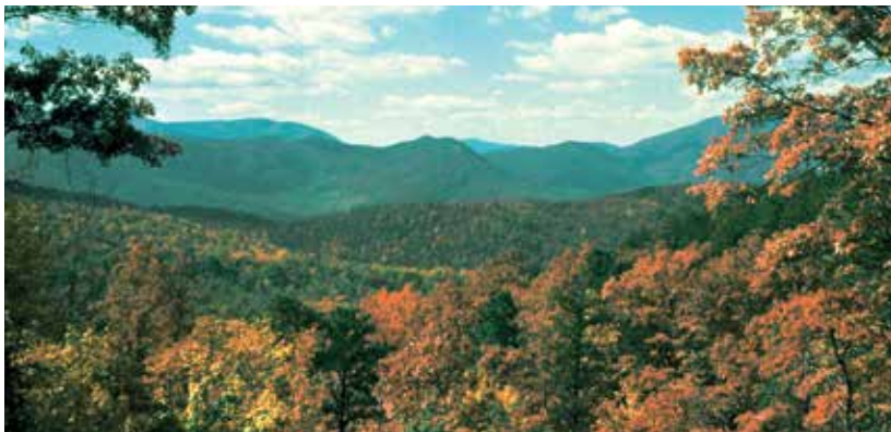
Autumn in the Smoky Mountains.

21 SWIFT CURRENT to CALGARY to EDMONTON: Tuesday . Today is "Going Home" day with many vivid memories of your music cities tour.