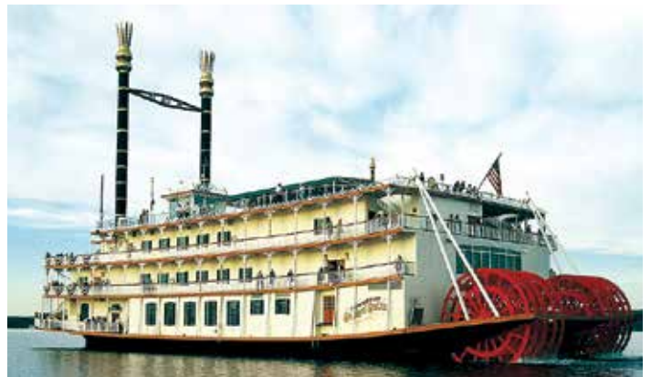
Showboat Branson Belle.