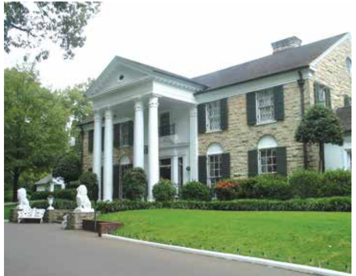
Graceland, Memphis, Tennessee.