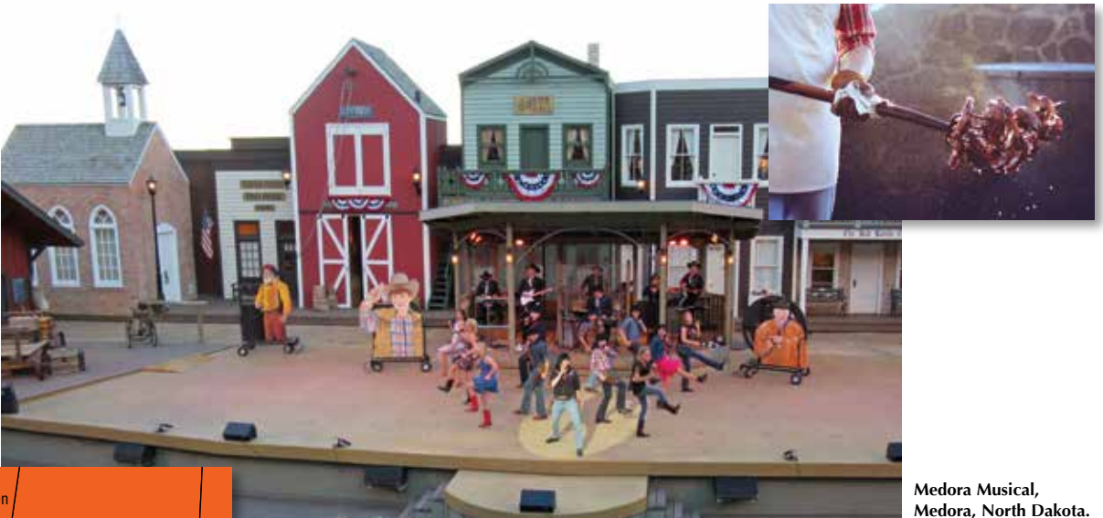
Medora Musical, Medora, North Dakota.