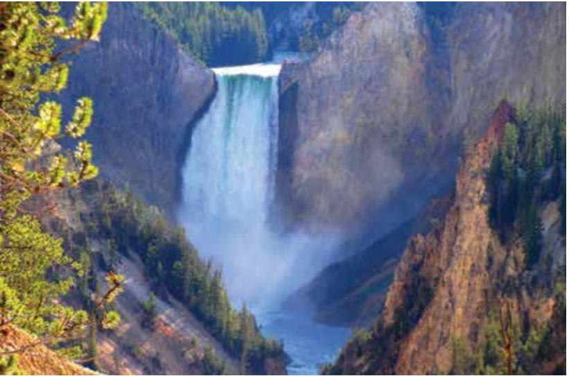
Grand Canyon Falls, Yellowstone National Park.

6 DEADWOOD to THE BLACK HILLS to DEADWOOD: Thursday. This morning travel through the BLACK HILLS NATIONAL FOREST to visit two of the world's largest mountain carvings. Ride the 1880 TRAIN on your way to the MOUNT RUSHMORE NATIONAL MEMORIAL. Afterwards, travel by motorcoach to the CRAZY HORSE MEMORIAL and return to Deadwood for overnight.