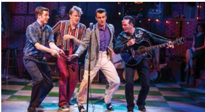
Million Dollar Quartet.