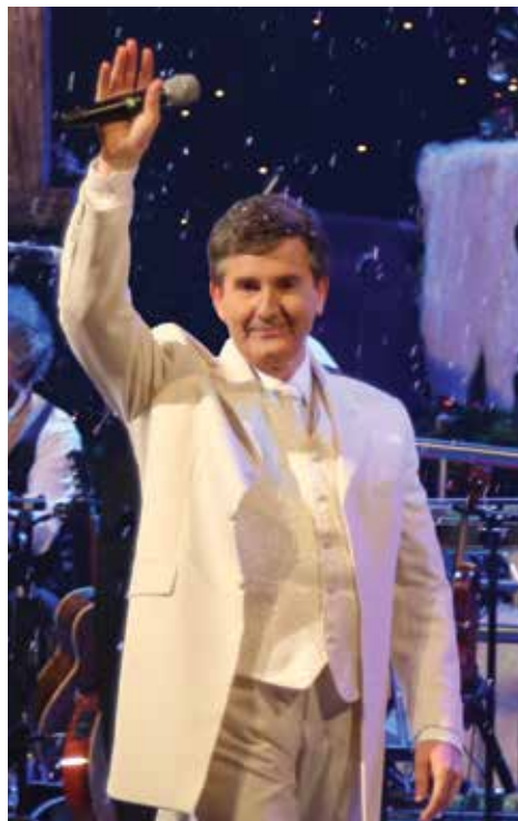
2023 Entertainer Daniel O'Donnell.