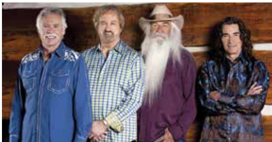
The Oakridge Boys.

EARLY BOOKING DISCOUNT: $45.00 twin sharing per person.