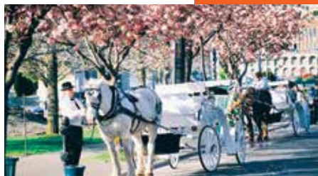
Early blossoms in Victoria.