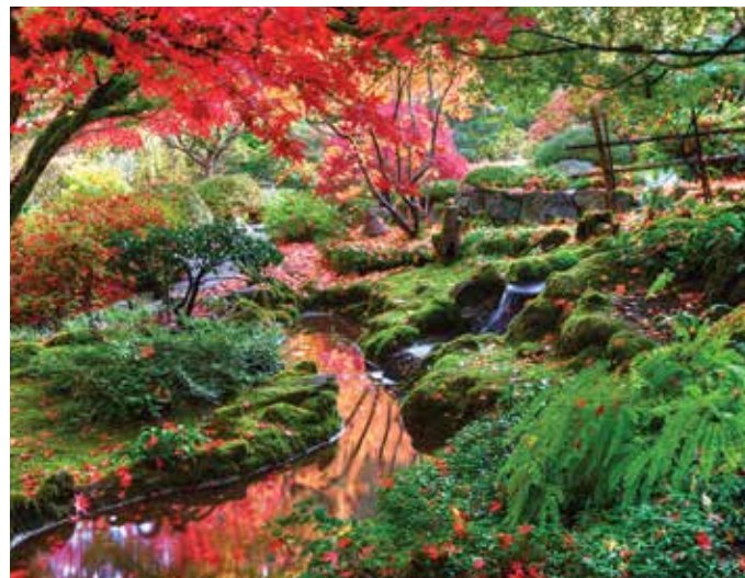
Butchart Gardens Autumn Splendour.

TWO BEAUTIFUL SEASONS TO CHOOSE FROM! Enjoy the early blossoms in the spring or the colours of autumn splendour in the fall.