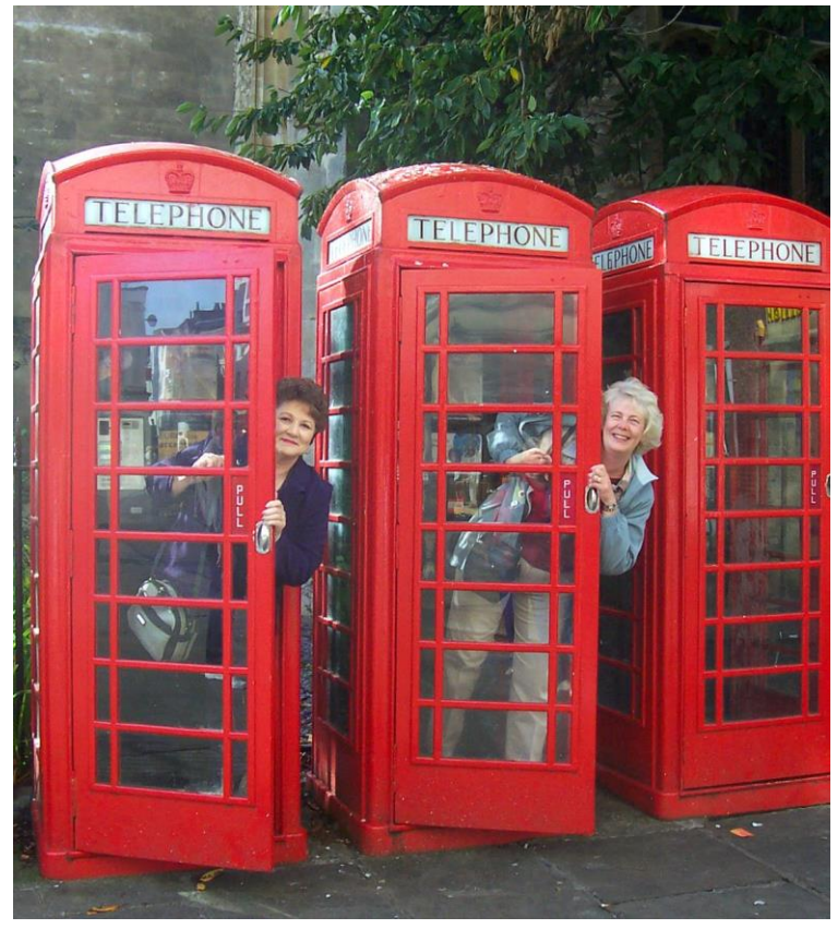
15 Days • 20 Meals: 13 Breakfasts, 1 Lunch, 6 Dinners

HIGHLIGHTS... Edinburgh, York, High Speed Train, London, Afternoon Tea, Stonehenge, Bath, Wales, Cardiff Castle, Welsh Evening, Waterford, Blarney Castle, Killarney, Ring of Kerry, Jaunting Car Ride, Dublin, Traditional Irish Night