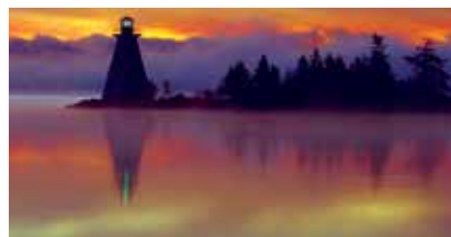
Baddeck, Nova Scotia.