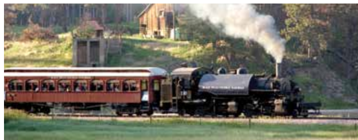
Ride the 1880 train.