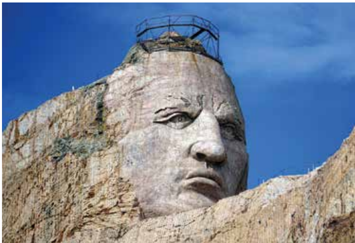
Crazy Horse Memorial.

Thursday. This morning travel through the BLACK HILLS NATIONAL FOREST to visit two of the world's largest mountain carvings. Ride the 1880 TRAIN on your way to the MOUNT RUSHMORE NATIONAL MEMORIAL. Afterwards, travel by motorcoach to the CRAZY HORSE MEMORIAL and return to Deadwood for overnight.