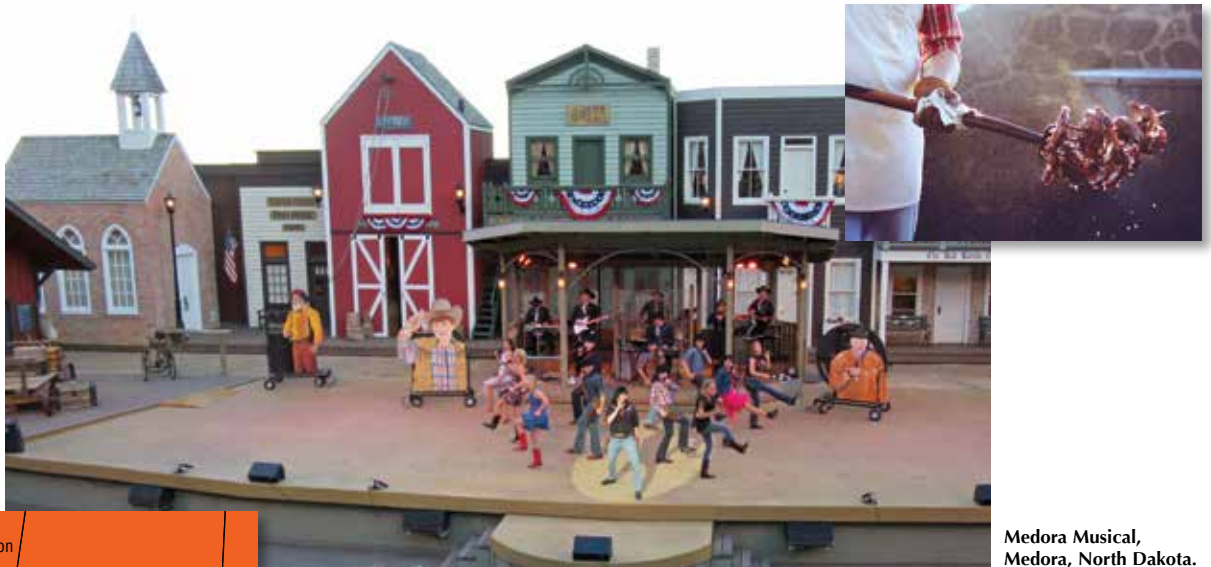
Medora Musical, Medora, North Dakota.