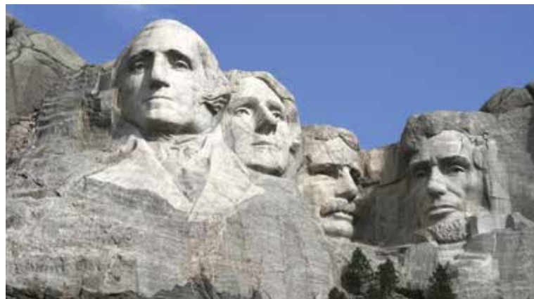
Mount Rushmore National Memorial.