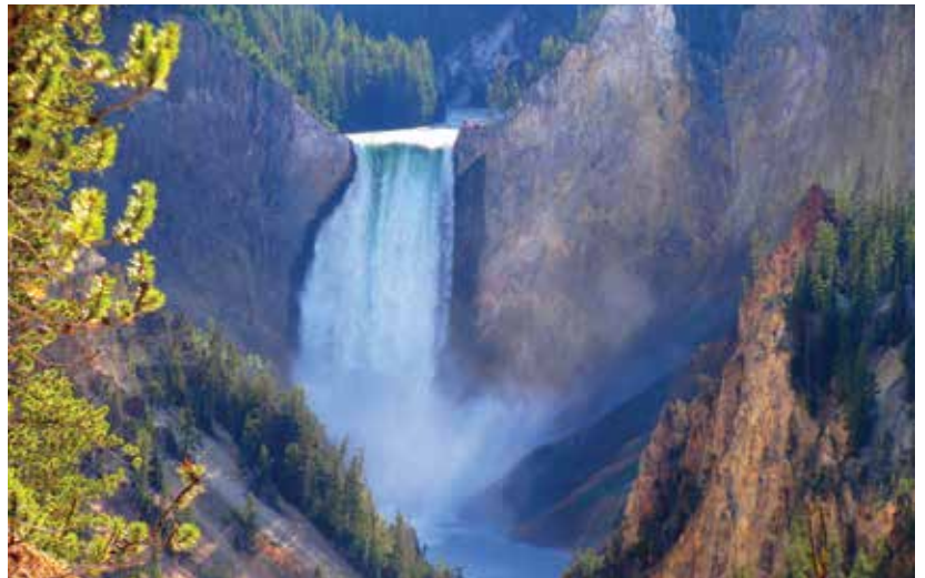
Grand Canyon Falls, Yellowstone National Park.