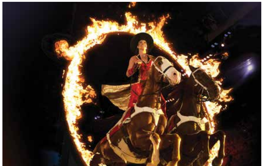
Dolly Parton's Stampede.

INCLUDED IN YOUR HOLIDAY: •First class transportation on an air-conditioned, washroom-equipped motorcoach •Quality accommodation and tax •Services of an experienced Tour Director and Driver •Baggage handling, one average piece per person •Travel Bag •Admission to attractions and sightseeing as outlined in the itinerary •Welcome Meet and Greet •Pizza Party •Fantastic Caverns •Six live music shows in Branson including a dinner cruise and show *Performance schedules may be subject to change •College of the Ozarks •Silver Dollar City Theme Park •Tree Lighting Ceremony •Trail of Lights Tour •Branson Landing •McFarlain's Family Restaurant •Dolly Parton's Stampede Dinner & Show •Mall of America •Farewell Dinner •Meals Include: All Breakfasts, 1 lunch, 5 dinners.