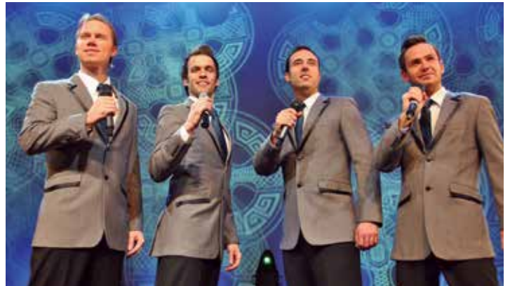
New Jersey Nights.