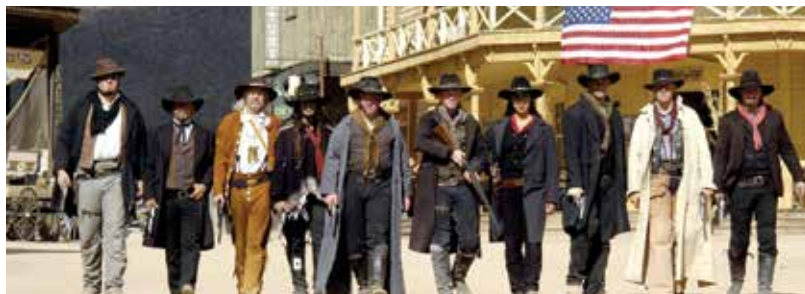
Gunfight at Tombstone, Arizona.