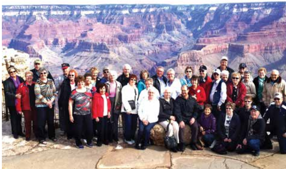
Grand Canyon, Arizona.